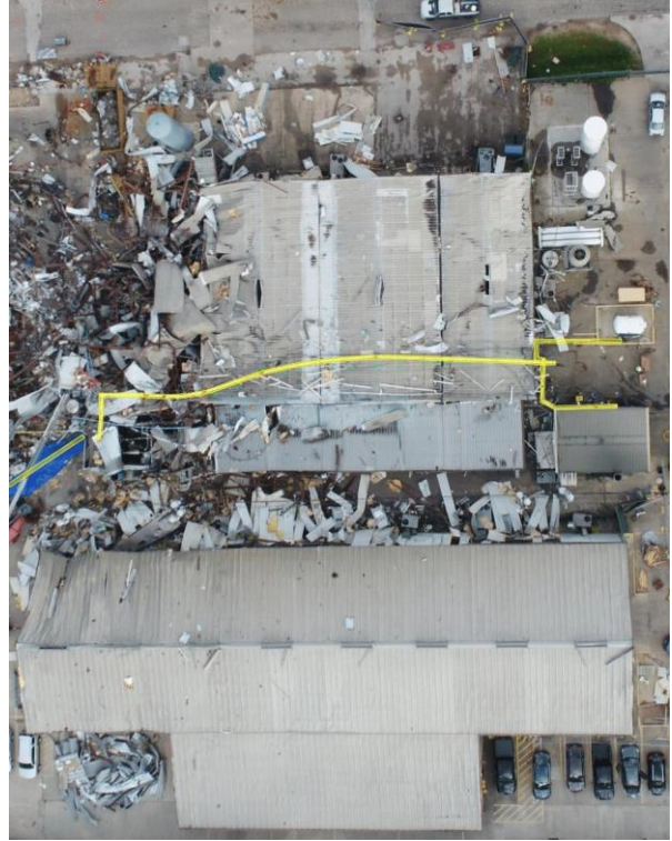
Pre and Post explosion aerial photos of Coating building (left) and ball lapping building/machine shop (right) with Propylene pipe remains highlighted in yellow. (Propylene piping denoted in the Pre-incident photo in red)

66. Pertinent to the issues in this case, located on the property was a storage tank that stored propylene. The propylene tank supplied propylene to the “Coating Building” through a piping system. (See Propylene piping system annotated in the above photographs for reference).